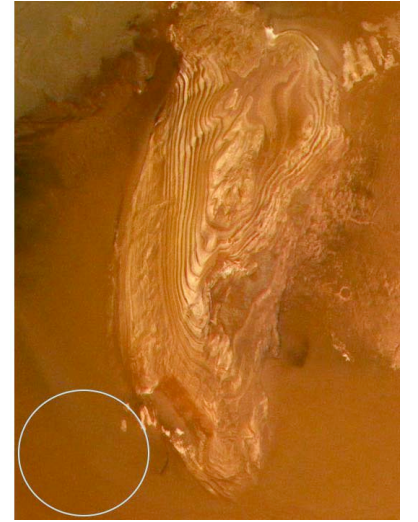
Figure 2: High Resolution Stereo Camera color image of interior layered deposits in Juventae Chasma with possible landing ellipse (~20 km diameter) located on the adjacent sand sheet. OMEGA shows the upper layers contain gypsum, whereas the lower material contains kieserite [23]. The layered deposits are over 2 km thick and the MSL rover could sample at least the lower half of the section by driving northward along its western side. Each layer could be studied because the soil-bedrock contact gains elevation to the north and allows access to successively higher layers.

(2006) JGR 110, E02S07. [15] Hynek B. M. (2004) Nature 431, 156-159. [16] Soderblom L. A. et al. (2004) Science 306, 1723-1726. [17] Golombek M. P. et al. (2003) JGR 108(E12), 8072. [18] Golombek M. et al. (2005) Nature 436, 44-48. [19] Hedges J. and Keil R. (1995) Marine Chemistry 49, 81-115. [20] Mayer L. M. et al. (1995) Geochim. Cosmochim. Acta 68, 3863-3872. [21] Keil R. et al.. (1994) Nature 370, 549-552. [22] Warren J. Κ. (2005) Evaporites Sediments Resources k Hydrocarbons. Springer-Verlag. [23] Bibring J-P, et al. (2005) Science 307, 1576-1581. [24] D. Y. Sumner (2004) JGR 109, E12007.